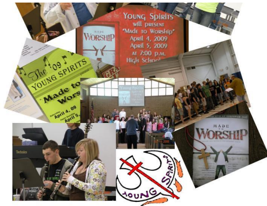
Pictures from the 2009 season of "Made To Worship".

Although times have changed our organization continues to be the same. The Young Spirits is sponsored by the Milton-Union Council of Churches and is led by an adult steering committee.